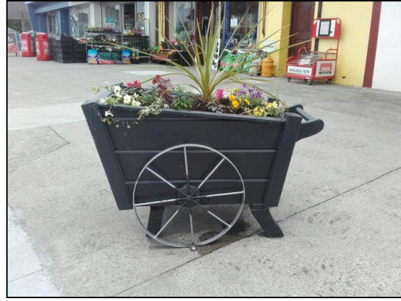
Participants from St. Brigid's school in Glasnevin with members of the Public Domain Team during their National Spring Clean event on Tuesday 4 th April and a decorative planter recently installed by the Public Domain Team at nearby Fitzmaurice Road