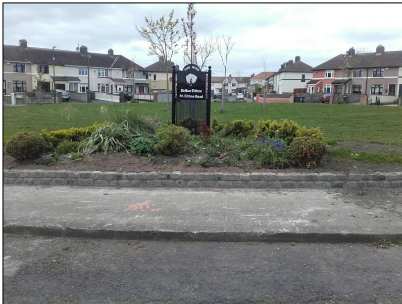
New kerbing installed around the green area on St. Eithne’s Road

Enhancement works have recently been completed at “The Ring” on St Eithne’s Road in Cabra. The old concrete kerbing around the green space on St Eithne’s Road has been removed and replaced with a new kerbing constructed from Old Dublin Cobble. The cobble, previously used in roadways in the city, was sourced over the last number of weeks and provides a very attractive enhancement to the green area. This work was undertaken with the co-operation of “The Ring Environmental Group” who had input into the design and choice of materials used. This group has been in existence for a number of years and has maintained this area to a very high standard. As this is one of the few green areas in the Cabra area, the Public Domain Team are keen to support this strong local environmental group in their valuable work.